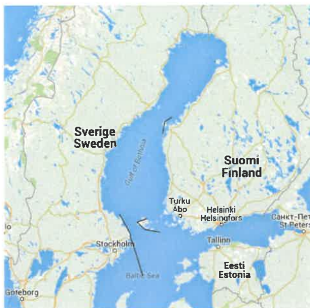
Illustration of Zone S and Zone F

Note: Geographical coordinates in WGS 84.